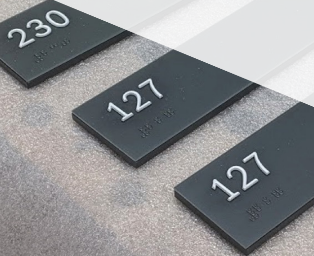
DIRECT PRINT ADA AND BRAILLE LETTERING